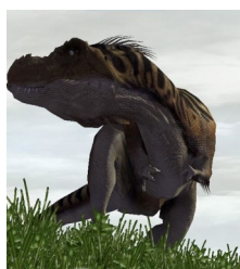
Dinosaur Exhibit Reading Public Museum