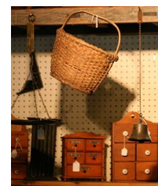
Stoudt's Antique Mall