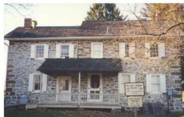
Reeser Farm House