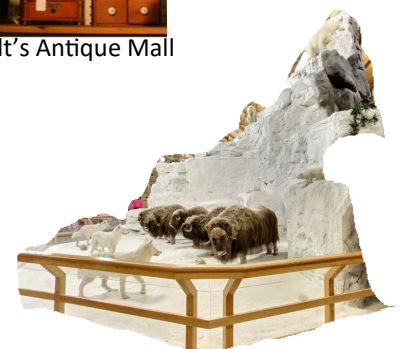
Cabela's Conservation Mountain Winter Side