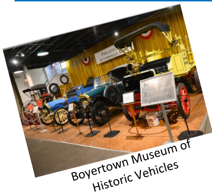
Boyertown Museum of Historic Vehicles

The song: "Cuanta Le Gusta" was performed as early as 1948 by Carmen Miranda and the Andrews Sisters and as late as within the last few years by Miss Piggy and the Pigs on the Muppet Show. The translation for "Cuanta Le Gusta" is How do you like it?"