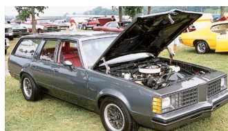
Maple Grove Raceway