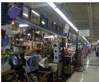
Fairgrounds Farmer's Market Collectable Stuff