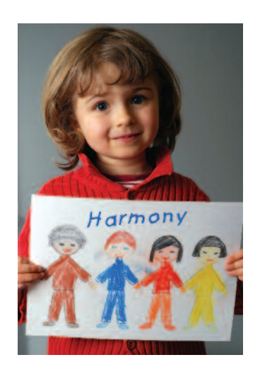
Bringing people together for a common cause