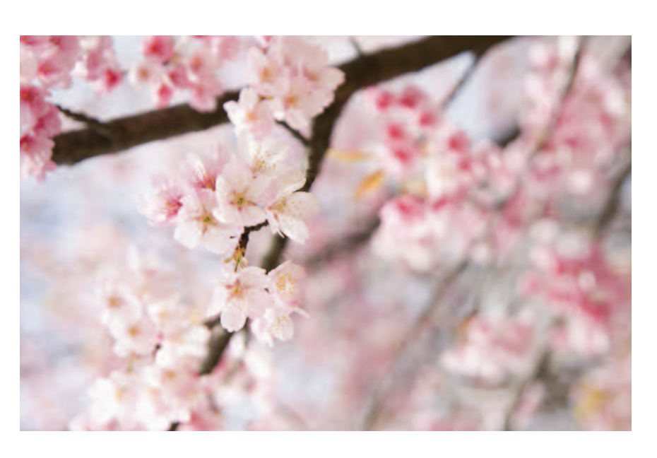
"Be kind. Be open. Be curious. Be strong. Be generous. Be sincere. Be loyal. Be honest. Be a Lion."

a common cause. We have shown time after time that national boundary lines are nothing more than dots on a map. In spite of conflicts and disputes throughout the world, we work beyond differences – a grassroots coalition of peace through service.