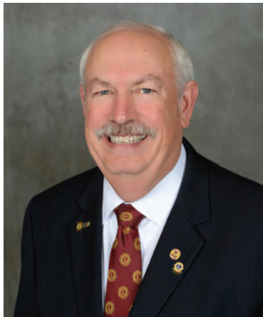
International President Chancellor Bob Corlew

The hills and mountains that form the backdrop of my home create a unique atmosphere. The natural boundaries of the Great Smoky Mountains formed over many generations a distinct culture with specialized dialects, a unique cuisine and a tradition of storytelling.