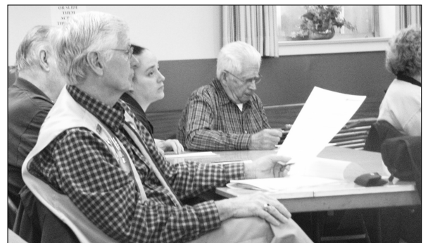
Workshop attendees hear the many ways to get community in Lions.

Unfortunately, out of 18 districts in Pennsylvania, 16 are at minus membership. Although District 14-K is below the desired mark, we have gained 17 since June 30, 2013. Let's do more!