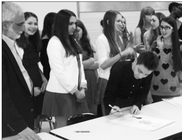
Saucon Valley Lions President looks on as Leos lined up to sign charter.