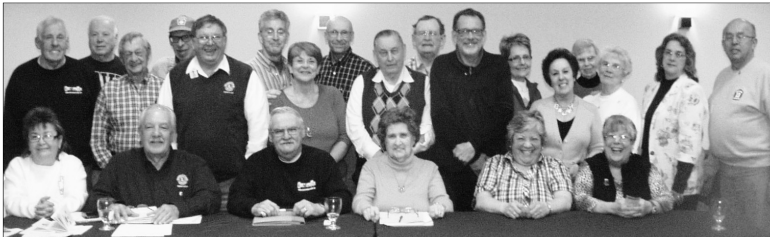
District 14-K 2014 Convention Committee