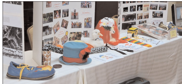
14-K Klowns display.