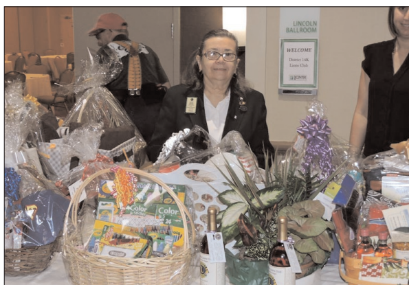
34 baskets were donated by the Lions and Lionesses.