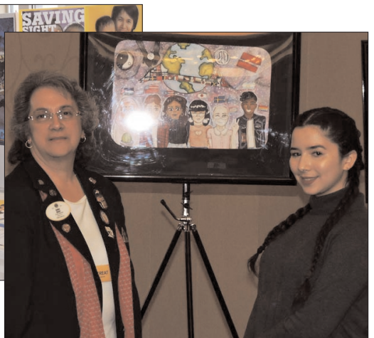
Outstanding Leos, Peace Poster winners, some of the