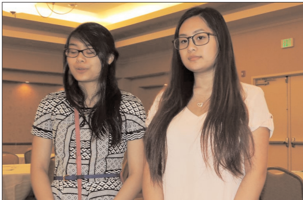
Leos told of their activities.