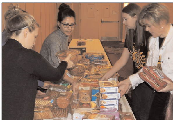
Leos box cookies for Meals on Wheels.