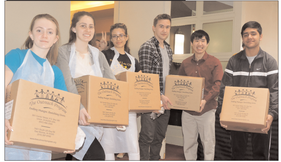
Leos in District 14-K had the project of packing thousands of meals for the elderly. These Leos are from Whitehall.