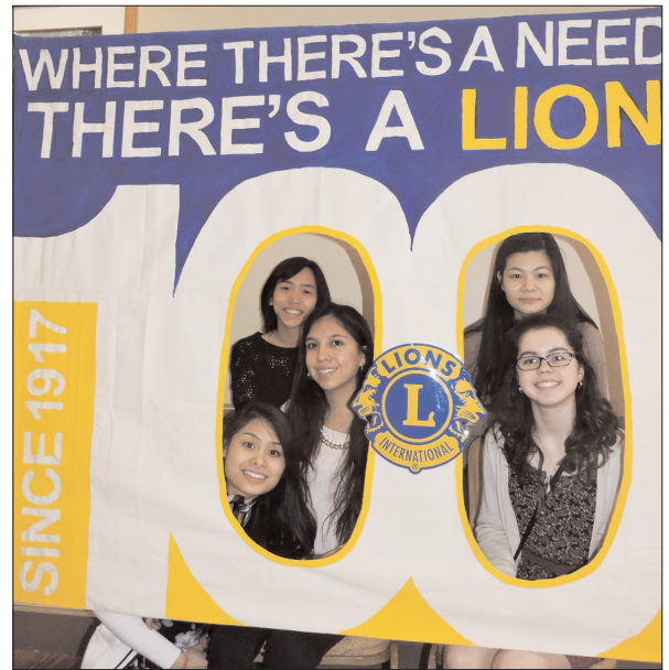
Even in high school, these Leos know that "Where There's a Need, There's a Lion".