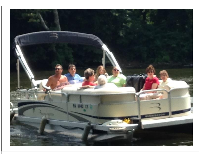
Clients of the Center for Vision Loss enjoy a boat ride on the Lehigh.

Some CVL clients have told us that they look forward to this event every year. It offers them the opportunity to meet with friends and socialize – something many of us take for granted.