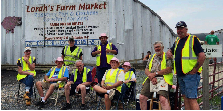
The Lehigh Township Lions Club fundraise at events Lorah's summer events, and we honor several members at Beacon Lodge (not all bricks for members pictured).