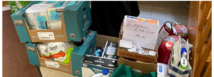
Donations to the Beacon Lodge Wish List from the Emmaus Lions Club. As always, they were very appreciative and thankful for the generous donation.