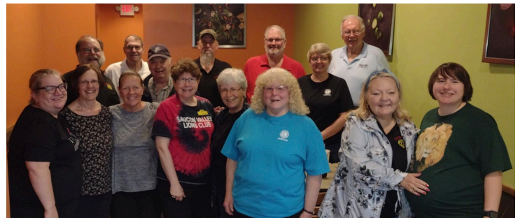
Saucon Valley Lions give a big Roar to Saladworks on Schoenersville Rd in Bethlehem on June 12th for all of their wonderful support of our fundraisers!