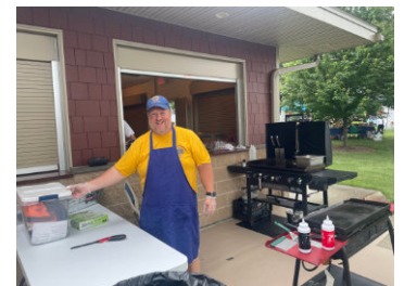
Upper Lehigh Lions held their Chicken BBQ on June 1 st . Thanks to all that bought tickets, supported, and helped. We appreciate you!