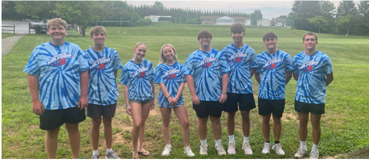
Emmaus Leo Club helped at the Upper Milford Youth Association Kickball Game.