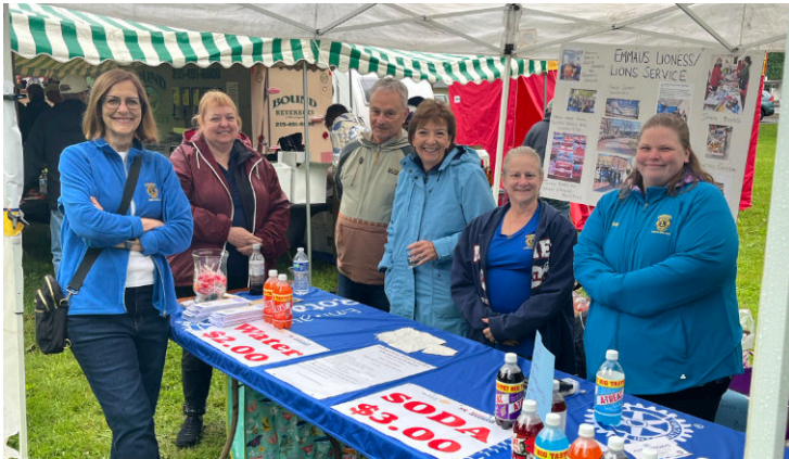
Emmaus Lioness Lions volunteering at the Rotary Summer Fest.