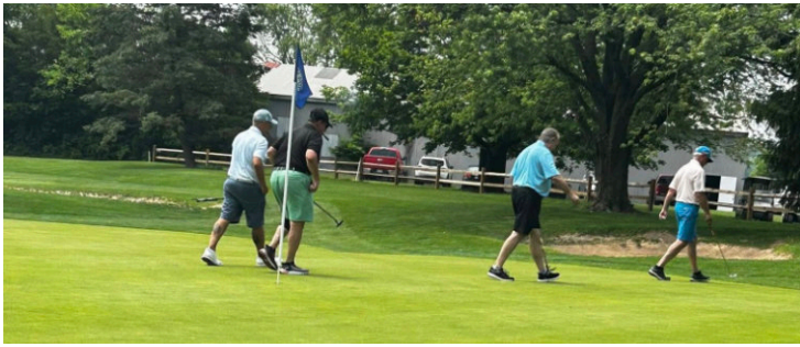
Bethlehem Township Lions held their 20 th Annual Golf Tournament on June 6 th . Thanks to ALL who supported. It was a great day!