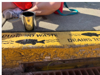
Emmaus Lioness Lions completing a service project by labeling "Dump No Waste Drains to Stream" on street drains in the Borough.