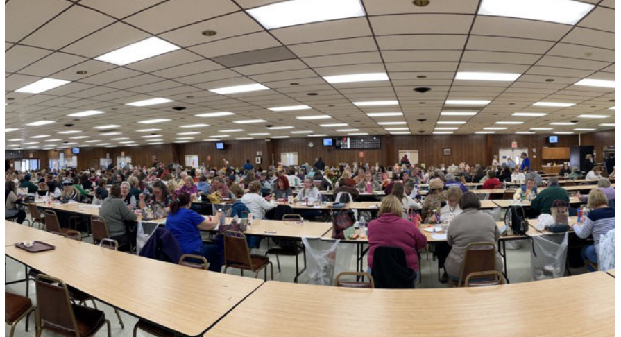
So many great prizes went home with lucky winners.