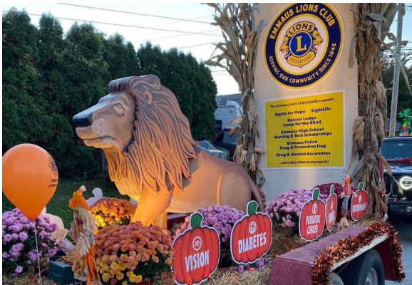
Emmaus Lions Club was in full force at the Emmaus Halloween Parade handing out balloons, pencils and of course promoting their Chowder Sale.