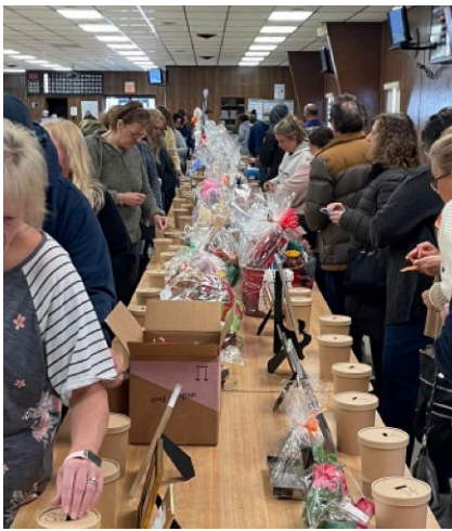
136 Baskets and Gift Cards with an assortment of great prizes.