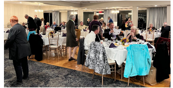
Upper Lehigh Lions Club had lots of old photographs and memorabilia on display for their 75 th Charter Night celebration!