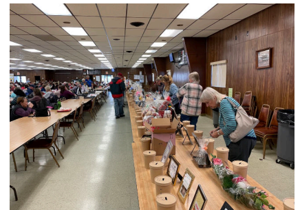
More Baskets and Gift Cards!