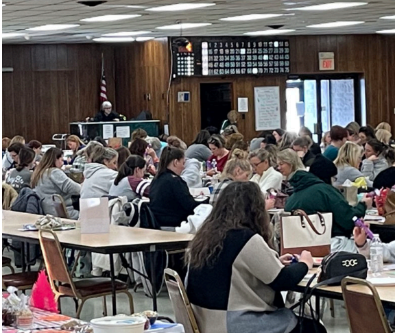
BINGO in action! So many great prizes went home with lucky winners.