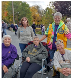
Lehigh Township Lioness Lions were represented at the Walnutport Canal Festival.