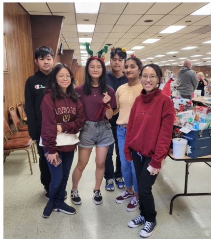
Our District Leos from Parkland and Northern Lehigh. Future leaders doing what Leos do best - Serve