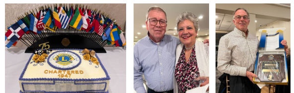
Additional photos on page 5