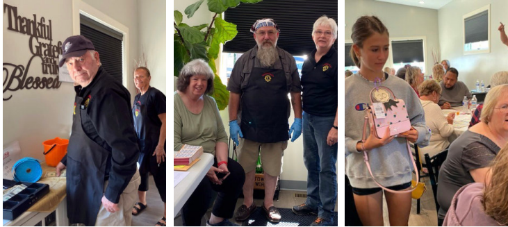
Saucon Valley Lions held a successful Purse Bingo on September 16th at the Heintzelman Carriage House in Hellertown.