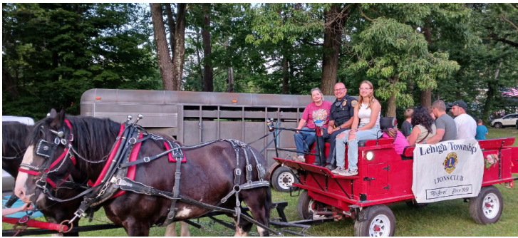
The Lehigh Township Lions Club supported activities for the Township's National Night Out on August 1, 2023.