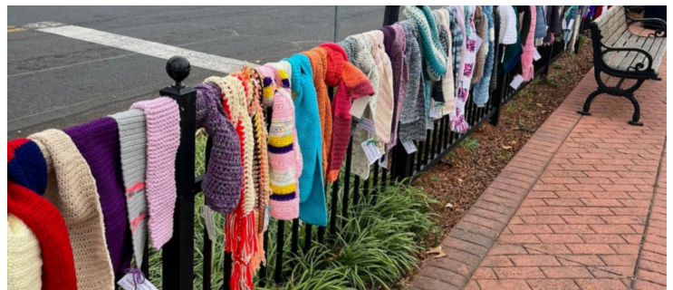
The Emmaus Lioness Lions Club held their annual “Chase the Chill” Free Scarf Giveaway event on November 4 th at Emmaus Triangle Park. All scarves were hand-made by members of the club.