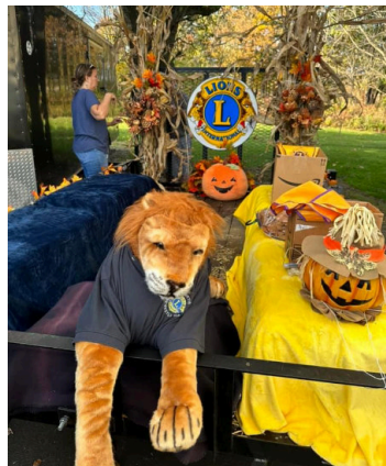
Alburtis Lions Club had so much fun being in the Alburtis parade and interacting with people in the community! It was a beautiful night.