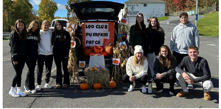
Fun time at Pen Argyl High School in October! Trunk or Treat for community kids by the PAHS Leo Club and their pumpkin patch! Community service for all ages! Thank you Leos