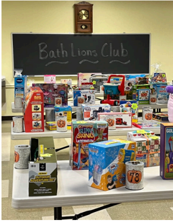
The Bath Lions Club held their annual Toy Basket Raffle Saturday and Sunday November 11 and 12th at St Johns Lutheran Church, in Bath Pa. It is their biggest fundraising event of the year.