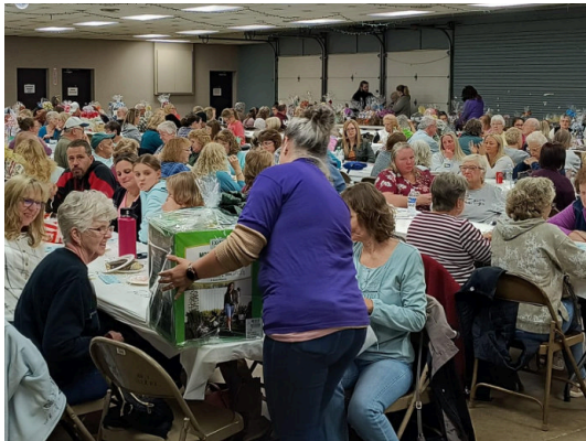
Upper Lehigh Lions Club Basket Social was held at the Schnecksville Fire Company on October 24 th