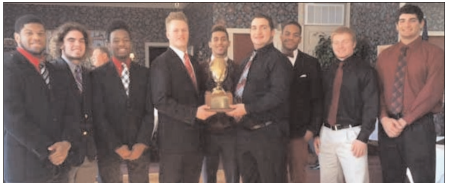
Winning team trophy was presented by the Easton Lions Club after the Easton-Phillipsburg Thanksgiving Day football game won by Easton High School. The team is shown gathered for the ceremony.