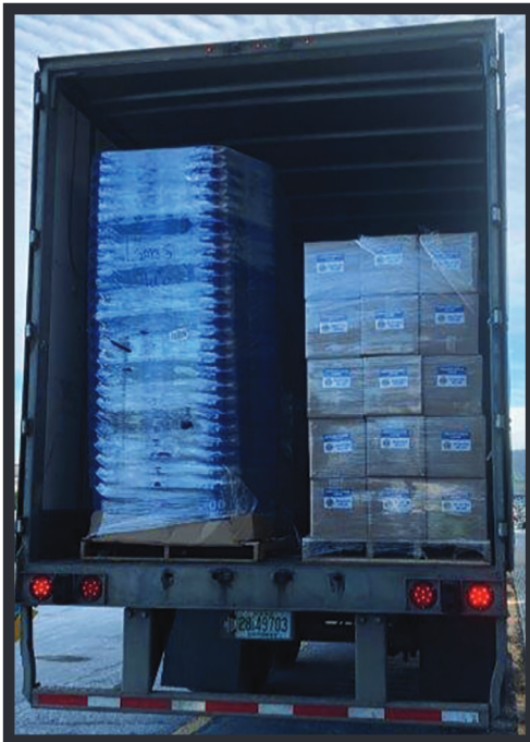
A trailer full of food and supplies departed the PA State Office in Harrisburg bound for Paducah, Ky., on Friday, Jan. 21, 2022