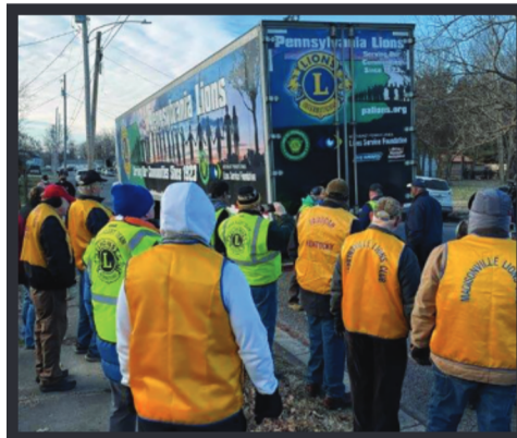
The trailer arrived to a warm reception in Paducah on Sunday, Jan. 23, and was unloaded into a warehouse two days later