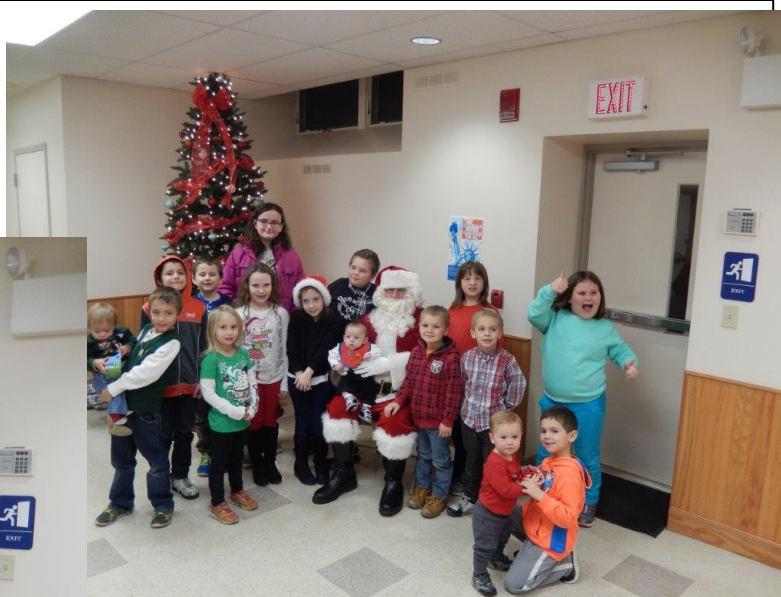
Children at the Plainfield Township Lions Christmas Party.

. Each child received a gift from the Salvation Army and a gift bag from the Lions Club. Santa was there to give the gifts to each child. Refreshments were served compliments of the Lions Club.