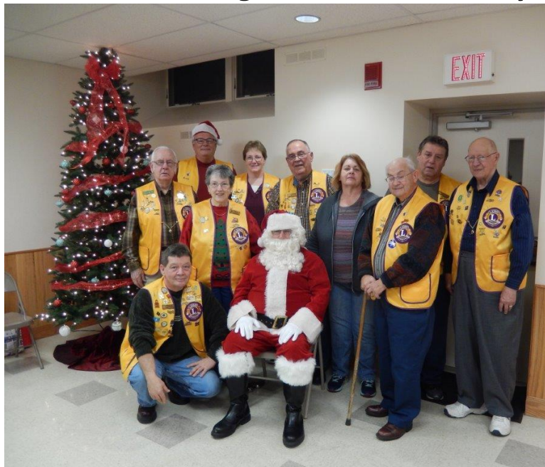
Plainfield Township Lions and Santa!

The Plainfield Township Lions Club hosted a Children's Christmas Party at the Pen Argyl Salvation Army on 12-09-15. The children were invited through the Salvation Army.