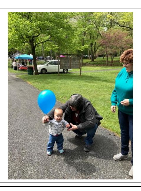
Feeding the masses while making new friends and staying dry at Mayfest