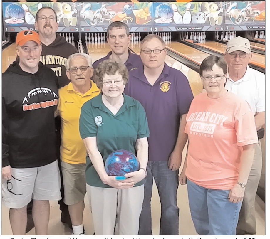
Bowl-a-Thon Lion and Lioness participants at Hampton Lanes in Northampton on April 23.

The Lions are ready to begin another successful year in Lionism and your presence will make it that much more meaningful in the transition between the two leaders. Let's celebrate!