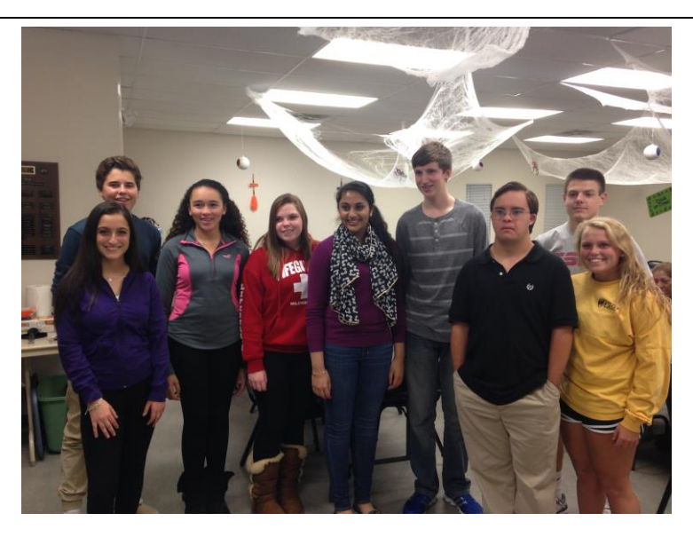
Leos from Parkland High School get some Hands On Experience

The guests were treated to a pork barbeque dinner and dessert followed by music, dancing and games. Members of the Saturday AM Lions were on hand to run some games for the children. A special treat this year was the addition of several members of the Parkland High School Leos Club. The Leos went straight into action helping to set up, serve meals, assists with the games and clean up at the end of the night.