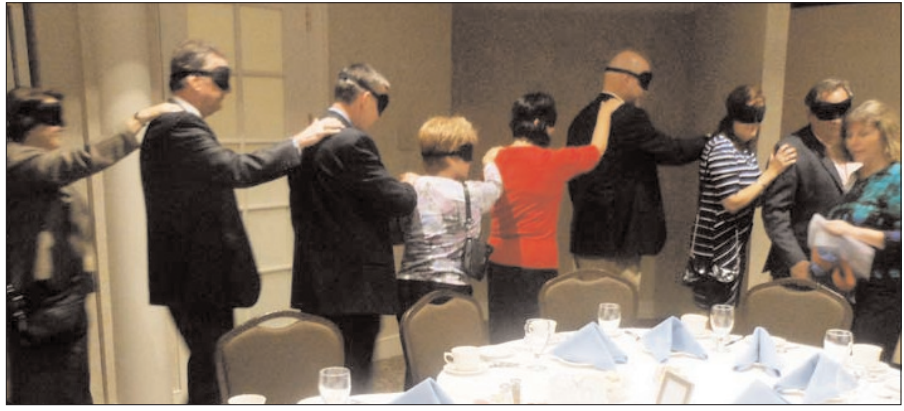
Air Products guests enter the room for "A Taste of the Shadows".