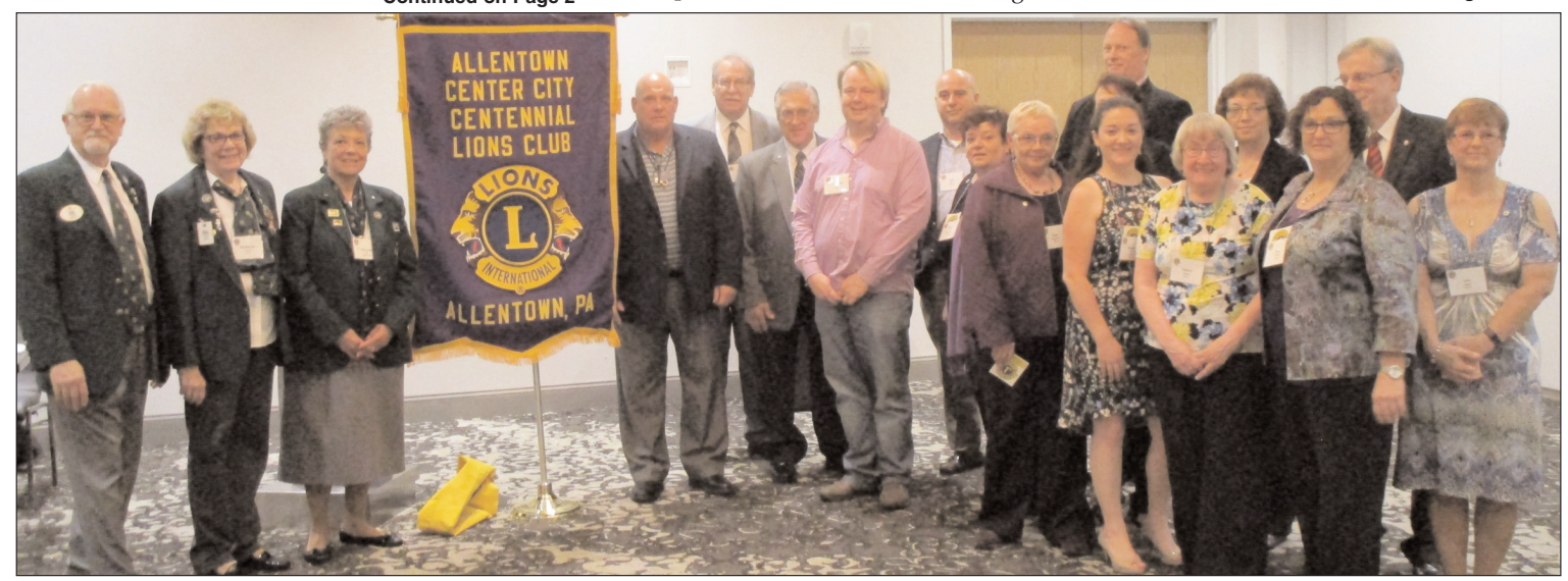
Congratulations to the new Charter Members and Officers the Allentown Center City Centennial Lions Club. Everyone was treated to a great meal, entertainment and fellowship. Thanks to members of the Upper Lehigh Lions Club for sponsoring this new club, and thanks to the clubs who attended and presented donations.