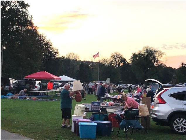
Vendors set up early in the AM