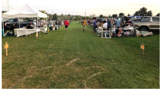
Another view of some vendors setting up