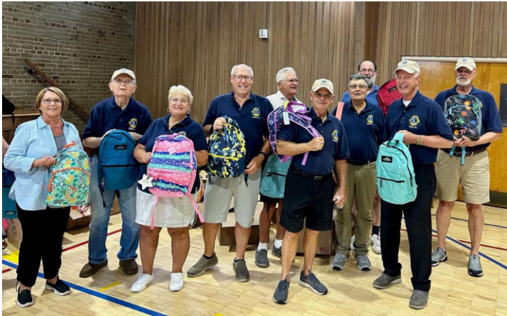
Easton Lions Club members volunteered to fill backpacks with school supplies to help Third Street Alliance. (20 hours of service)