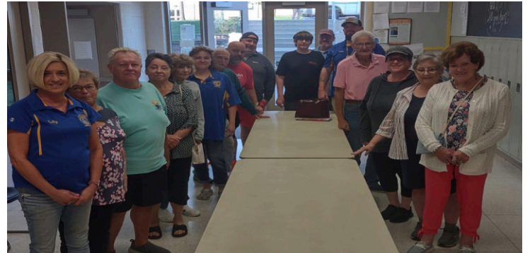
Wilson Borough Lions Club volunteered at the LINC'S Community Center in Wilson Borough on August 20 th by assembling 250 Warrior Bags. These bags are filled with non-perishable food items that are sent home every Friday with district students who face food insecurity.