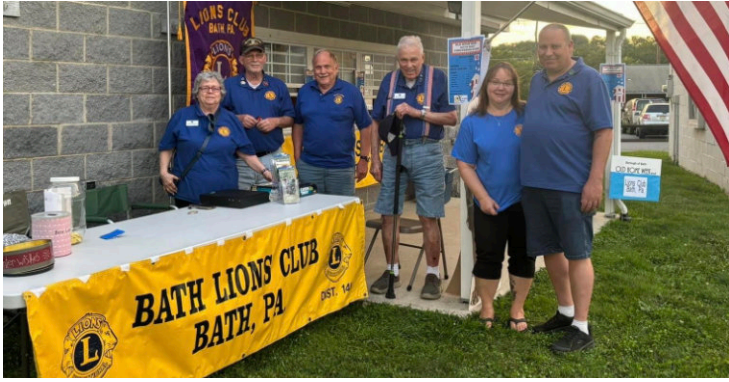
Bath Lions Club ran the snack stand at old home weekend in the borough of Bath on August 12th. We sold popcorn water and candy for movie night.