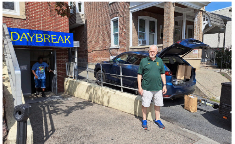
All leftovers from the Ham & Turkey dinner were given to The Lehigh Conference of Churches, Day Break, a faith-based, nonprofit agency connecting basic human needs to the most vulnerable people in the Lehigh Valley.