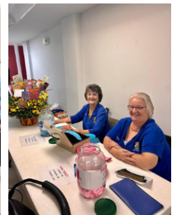
Emmaus Lioness Lions held their Chicken Pot Pie Bingo September 28 th . Everyone had a great time. The pot pie was delicious! Thank you to everyone, It was a fabulous event!