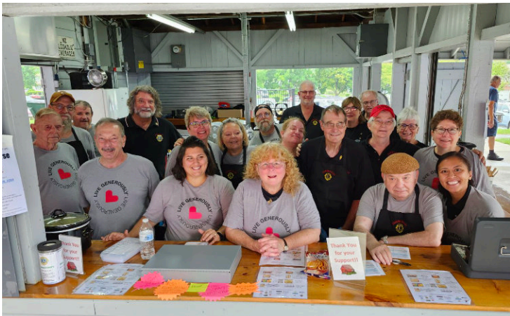
On August 17th Saucon Valley Lions manned the Dimmick Park Pavilion serving food for the Hellertown Community Day, which took place from 10:00 AM - 3:00 PM at the park.