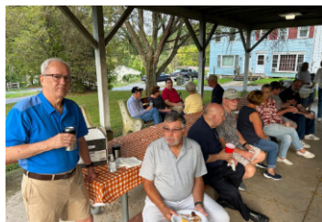
Easton Lions Club Held their annual fall picnic on Tuesday, September 17th at Poswistilo Pavilion in Glendon, PA