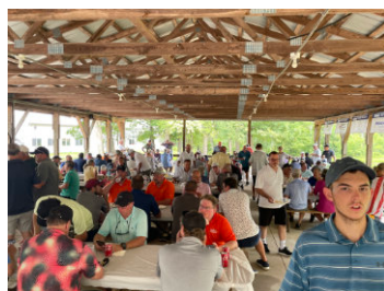
Emmaus Lions held their annual Golf Benefit on August 2 nd .