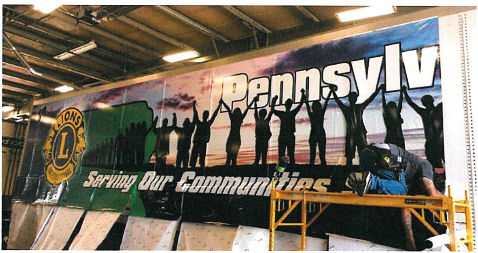
Wrapping up the job